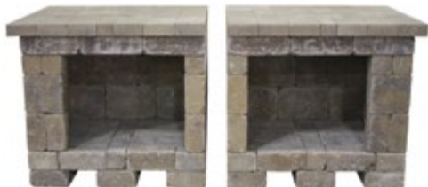
Wood Boxes 2'4"D x 2'8"W x 2'11"H per box