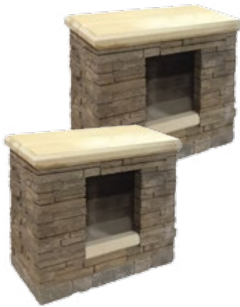
Wood Boxes 2'1¼"D x 3'3"W x 3'1"H per box