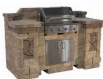
Grill Island 3'D x 6'4"W x 4'4"H