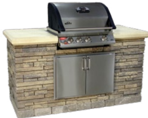
Grill Island 2'6"D x 5'11"W x 3'5"H