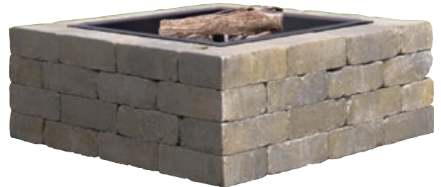
Weston Stone™ Fire Pit Kit

Belgard's Fire Pit Kits install quickly and offer many different looks from the clean and contemporary look of tumbled stone to the natural textures of stacked stone. Kits are available in three popular styles developed to complement most Belgard® paving stones and retaining walls.