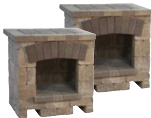
Wood Boxes 2'4"D x 3'W x 3'3"H per box