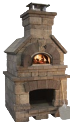
Brick Oven 4'D x 4'W x 8'5"H