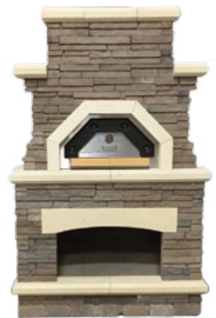
Brick Oven 42½"D x 53¼"W x 92"H