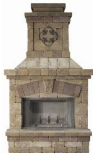
Fireplace 3'4"D x 4'8"W x 8'4"H