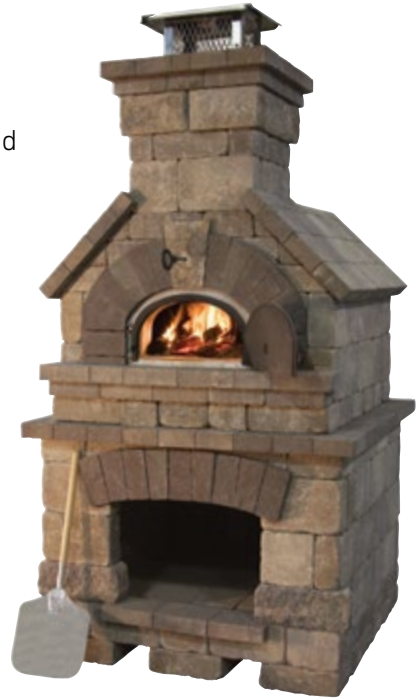
Bristol™ Series Brick Oven

Available in Bordeaux™ and Bristol™ Series.