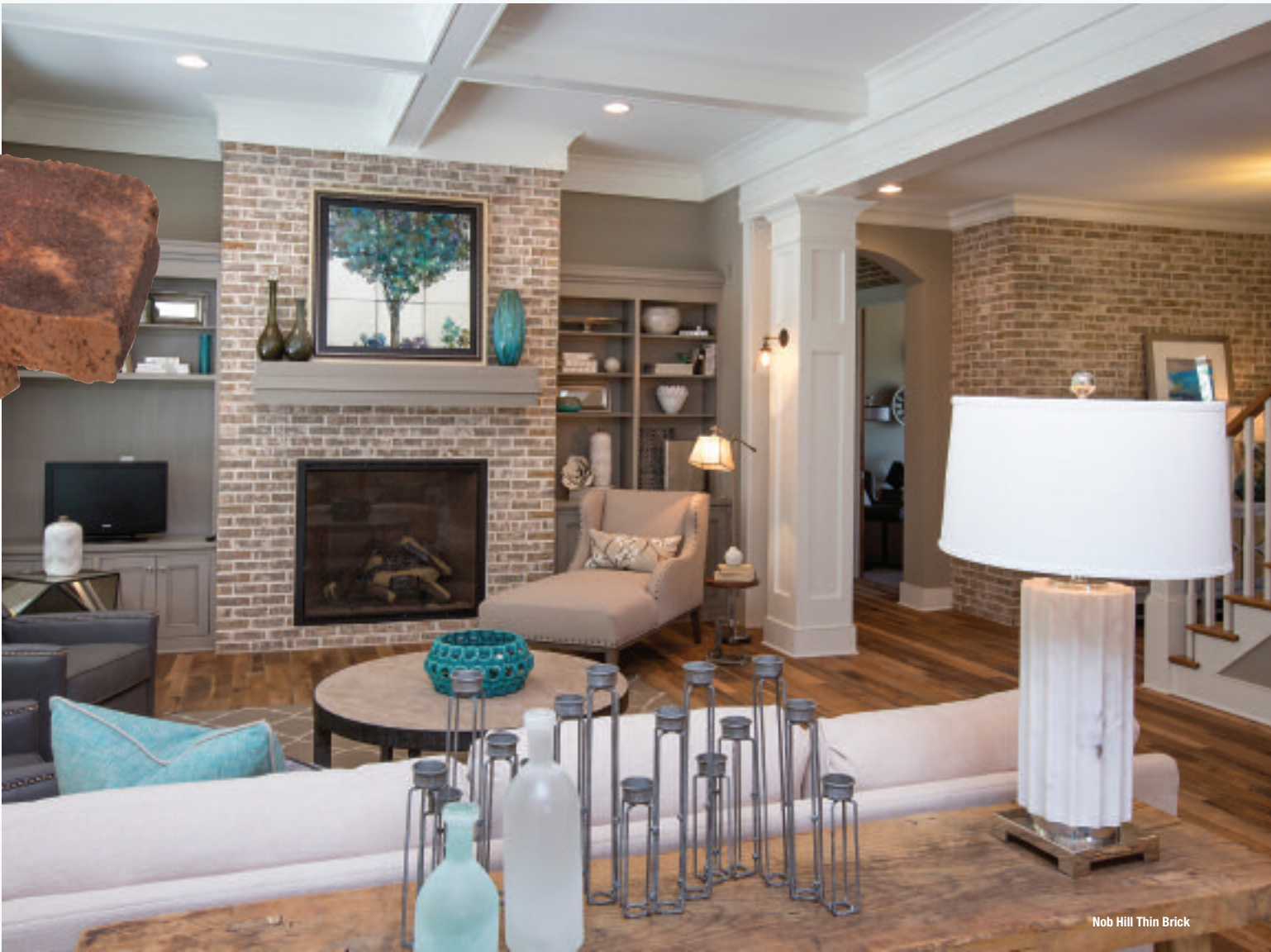
Nob Hill Thin Brick