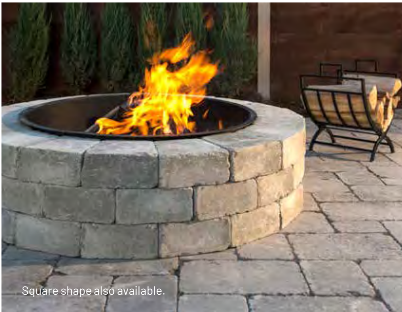
Square shape also available.